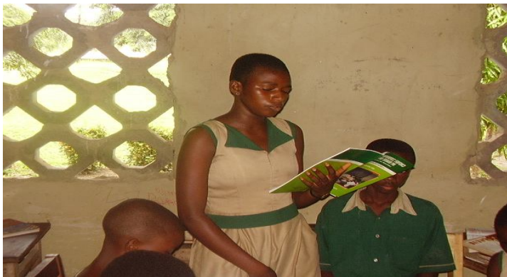
Hearts Literacy Primer Level Two, in Wassa Amenfi District Western Region, Ghana

A picture of a student reading the Twi Enlightening the