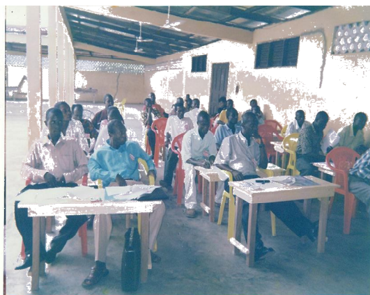
Teacher Training Workshop, 2011

A total of 231 students were involved in the baseline exercise. The results showed that 42% or 96 out of 231 students who took the test were literate.... only 13 or 6 % were semi - literate while 52% or 121 were non -literate (see next page for details).